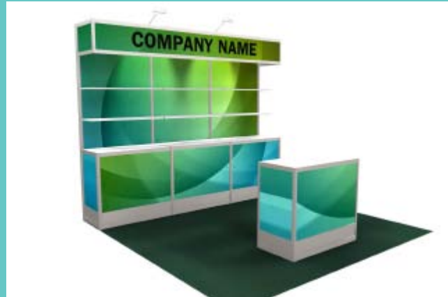
Package 4 upgraded with graphics and cabinet