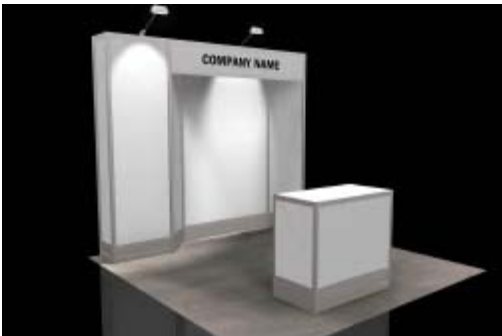
Cabinets & Counters