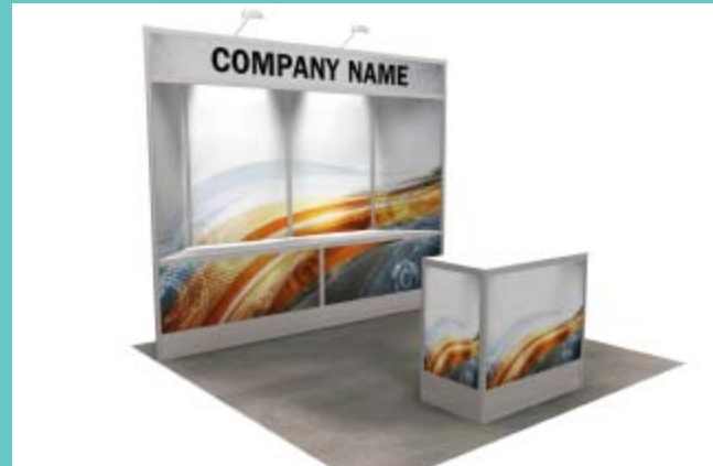
Package 3 upgraded with graphics and cabinet