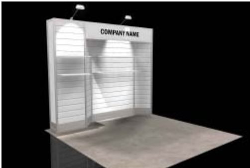
Slatwall & Shelves

All packages can be customized or modified. To speak with an Exhibitor Sales specialist call the number listed on Quick Facts. For additional custom examples visit the link at the bottom of the page.