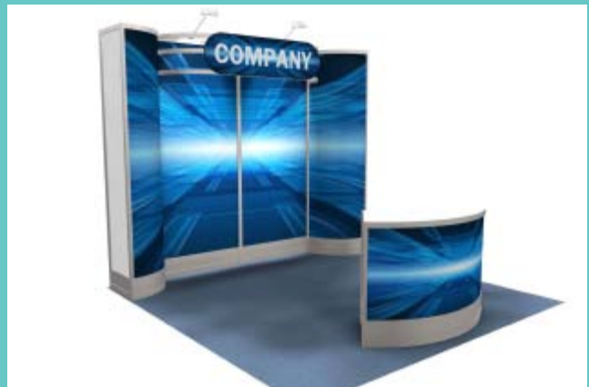
Package 6 upgraded with graphics and cabinet

Power and labour to hang the lights are included in our standard rental exhibit package price. Power consumption not to exceed 500 watts