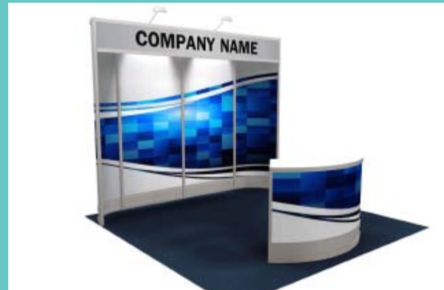
Package 2 upgraded with graphics and cabinet