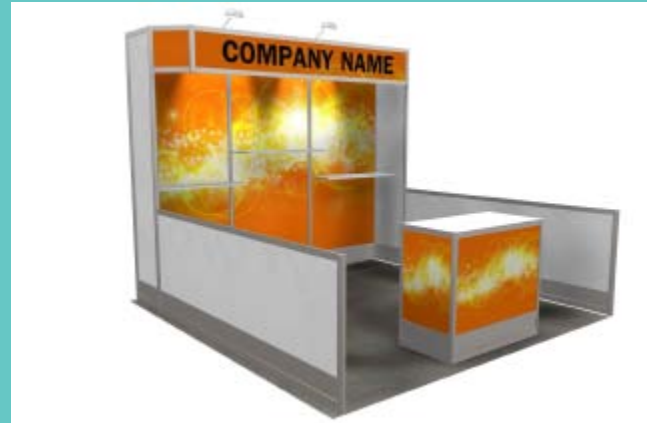
Package 1 upgraded with graphics and cabinet