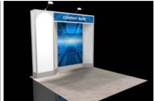
Graphics & Custom Logo