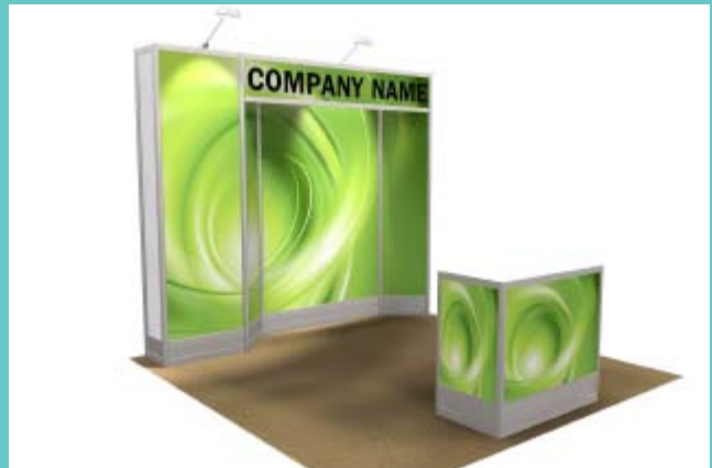
Package 5 upgraded with graphics and cabinet